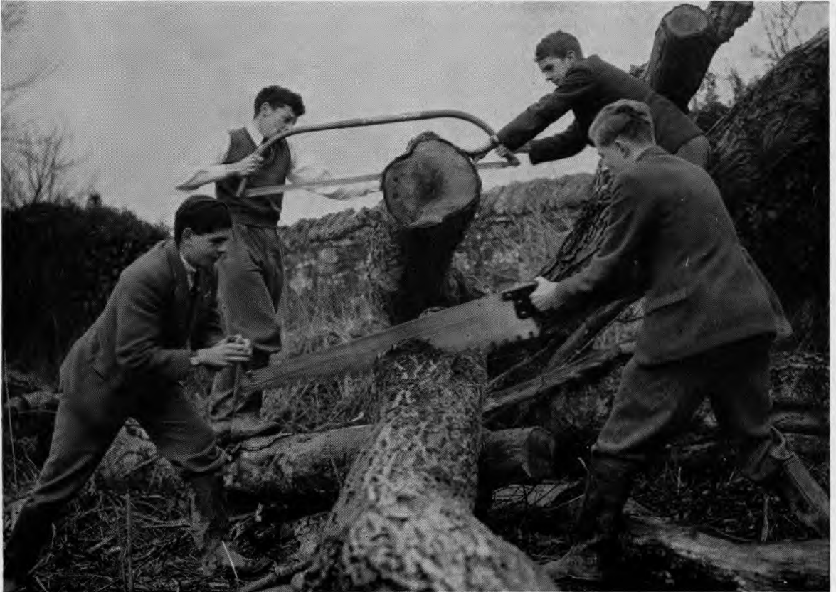
Below and opposite: Station.