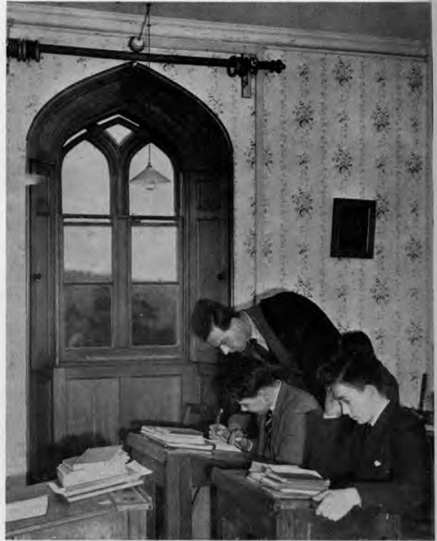
Above: Work in Saltmarsh.

Grants, at any rate, took the opportunity of dispensing with what little fagging still survived, in the hope of continuing, as far as possible, the family association between adult and boy, between older boy and younger boy, that we had become accustomed to in evacuation.