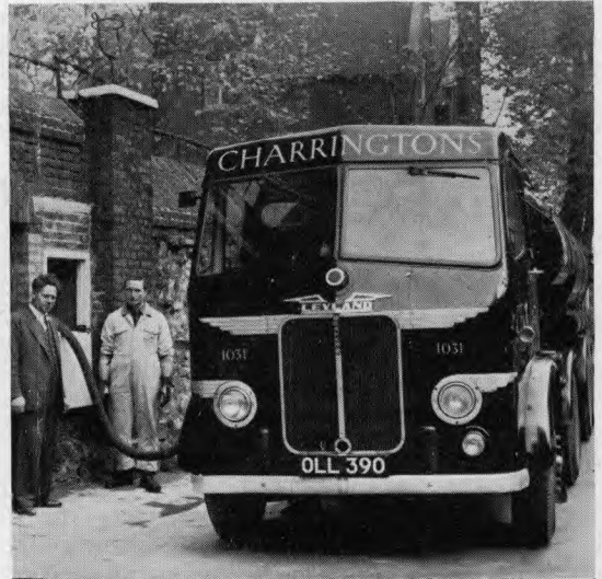
A tanker refuelling College's oil-consuming boiler